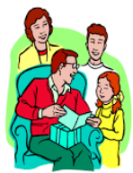
Myself and My Family

In Pre-Nursery this week the focus has been on continuing to settle the children and ensure each and every one feels safe and secure within their new environment. I have been delighted to pop into the Pre-Nursery classrooms at different times of the day to find the children busy learning and actively engaged in a variety of exciting learning opportunities. The topic for this half of the term will be Myself and My Family. We will communicate the weekly activities associated with this topic through the Pre-Nursery newsletter.