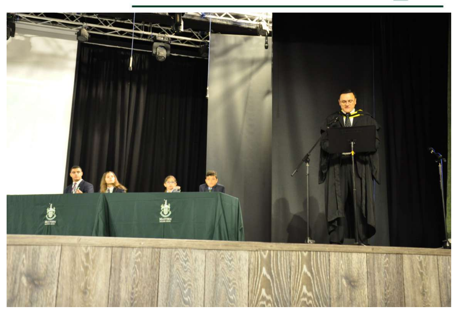
Thursday 28th June 2018

Dear Parents and Friends of Malvern College Egypt,