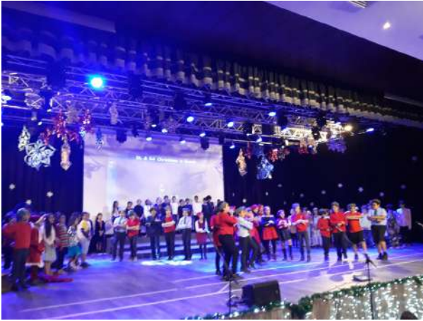
The Year 5 Russian Dance

routines relating to different countries. For many pupils it was the first time learning to sing and dance for a stage show. Here are a few photos from the concerts: