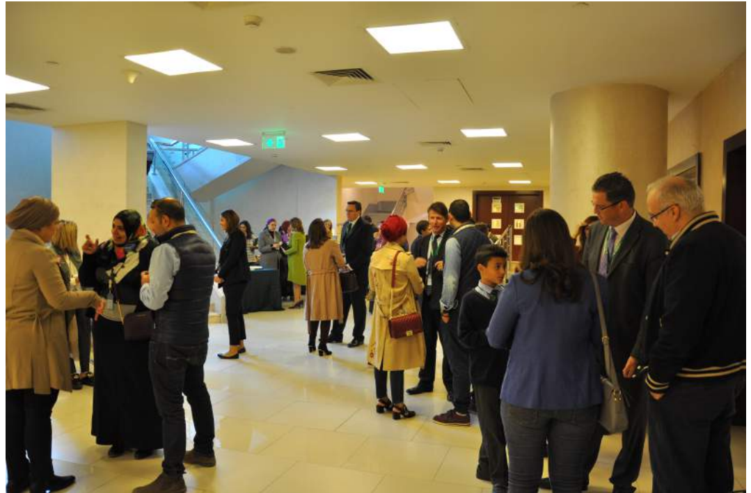
Thursday 7 th December 2017

Dear Parents and Friends of Malvern College Egypt